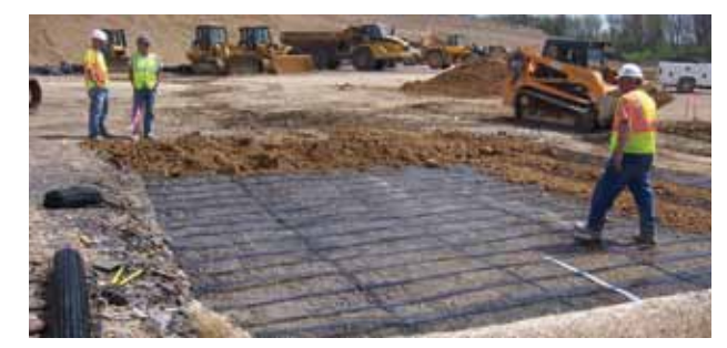
Years of experience from the industry leader make Tensar Engineering and field support services second to none.