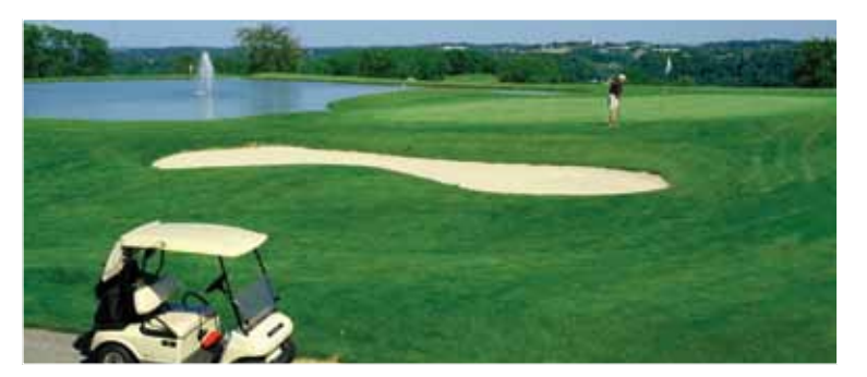
Land revitalization made possible with geosynthetics.

When faced with the high-cost option of undercutting the variable subgrade offered by a typical environmentally contaminated site, the inclusion of a stiff, Tensar TriAx Geogrid layer offers an economically attractive and practical alternative. Potential applications of Tensar Geogrids include the development of parking lots, sports fields and bike paths constructed over closed waste containment structures.