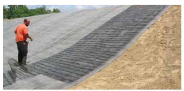
Their pronounced and more closely spaced transverse bars makes the Tensar SB products ideal for veneer stability applications.