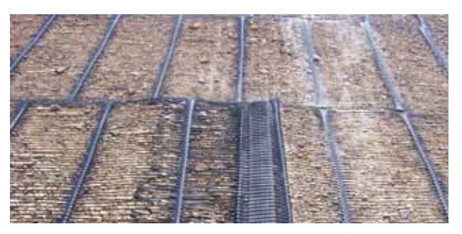
Tensar UX Geogrid structural connections minimize waste factors.