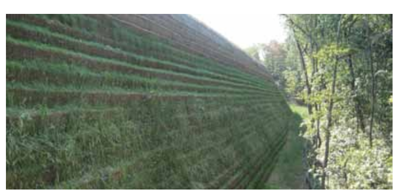
ADD<sup>3</sup> steep berms increase landfill capacity within boundary constraints.

ADD<sup>3</sup> Systems may not only extend the life of a landfill, but they can also simplify the closure of impoundments and sludge ponds. Even when all other conventional technologies have failed, Tensar's ADD<sup>3</sup> Capacity Improvement Systems have been able to successfully and securely close sites while reducing expenses.