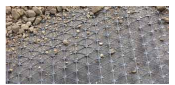
Tensar TriAx Geogrids, designed to interlock and confine aggregate particles to create a mechanically stabilized layer with improved bearing capacity.